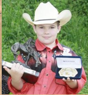
Buckaroo: Hammer Rock