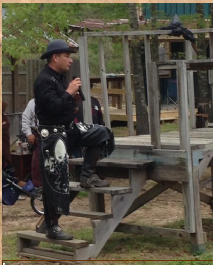
Slick McClade Kicks Off the Festivities