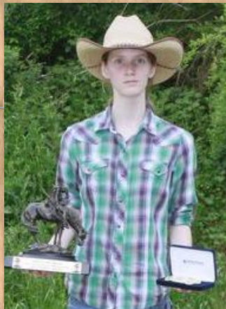
Lady Gunfighter: Irish Leadslinger