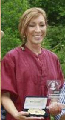
Lady 49er: Redemption