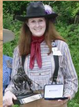
Lady Frontier Cartridge: Bama Belle